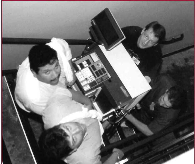
Biomedical equipment technicians helped to evacuate both patients and equipment in the aftermath of Tropical Storm Allison.

When Dreps arrived on the scene early that afternoon, about 22 feet of water stood between the basement and the ground floor of the main hospital building. Four other buildings were also flooded. With many of his staff trapped by the flooding and unable to get to the hospital,