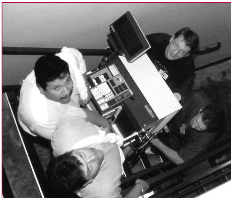
Biomedical equipment technicians helped to evacuate both patients and equipment in the aftermath of Tropical Storm Allison.

When Dreps arrived on the scene early that afternoon, about 22 feet of water stood between the basement and the ground floor of the main hospital building. Four other buildings were also flooded. With many of his staff trapped by the flooding and unable to get to the hospital,