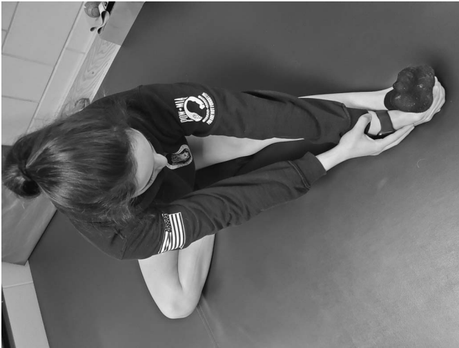
Figure 1. Targeted stretch of the semimembranosus.

profiles reflected full range of motion and full strength throughout each range except for patient 7, who presented with limited knee flexion on manual muscle testing of 4/5 on the involved side secondary to increased pain. Anterior drawer, McMurray, and patellofemoral apprehension tests were all negative, and the valgus stress tests reproduced the pain but were negative for laxity in all patients. A shared complaint of increased tension and subsequent discomfort along the medial hamstrings muscles during assessment of straight-leg raise hip flexion added SM involvement to the differential diagnosis.