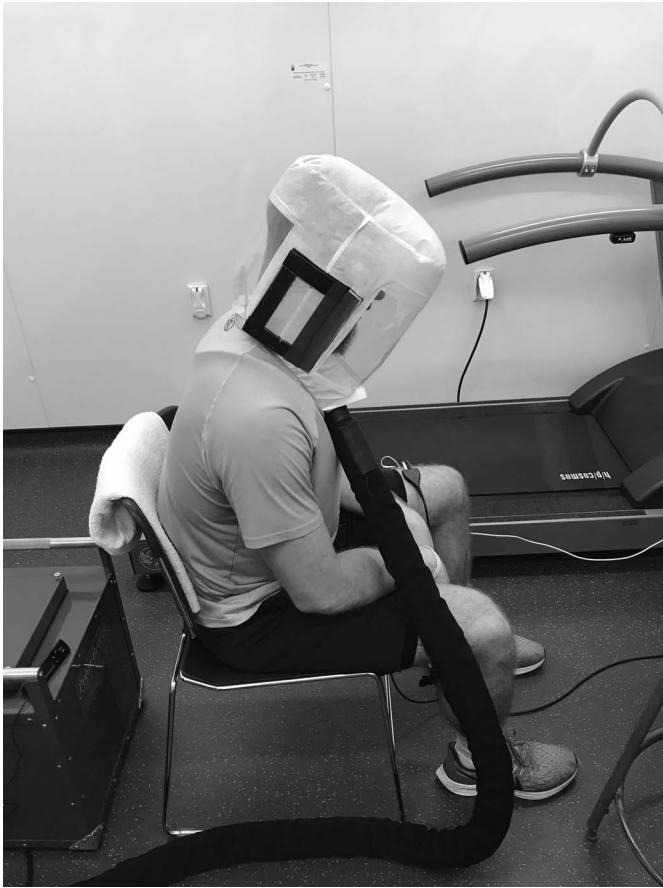
Figure 1. The Polar Breeze (Statim Technologies LLC) thermal rehabilitation machine during operation.

Throughout exercise, T_{REC} and HR were measured continuously, and perceptual scales were assessed periodically.