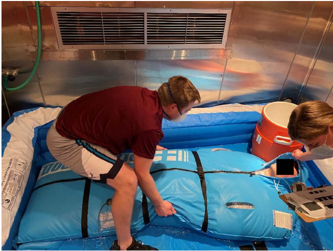
Figure 1. Participant immersed in the Polar Life Pod (Polar Products Inc) while investigator oscillates water.

temperature and added ice as necessary to keep it close to 15°C (59°F). We were careful to ensure that any added ice had melted before participants entered the tub. The bath was stirred continuously with a plastic rod until participants' T_{REC} was reduced to 38°C. A separate No. 401 thermistor was secured approximately 20 cm from the bottom of the tub so we could monitor and record tub water temperature during cooling.