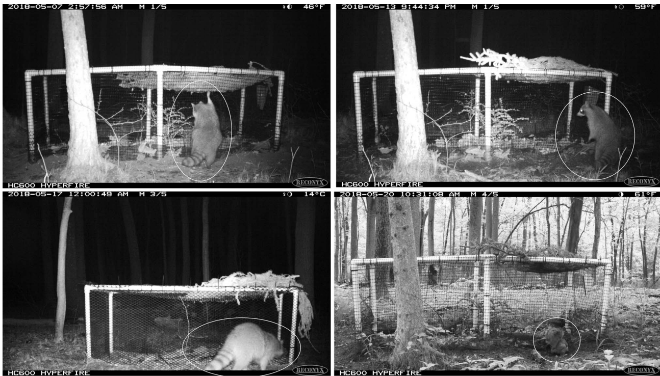
Figure 1. Visits by predators (circled) to acclimation pens containing juvenile eastern box turtles ( Terrapene carolina ) at Fort Custer Training Center, Michigan, USA, documented with motion-triggered cameras. Counter-clockwise from top right: raccoons ( Procyon lotor ) in the first three images and fox squirrel ( Sciurus niger ) in the fourth image.

were buried approximately 10 cm into the ground to keep predators from entering and prevent turtles escaping. Four turtles were placed in each pen. We provided fresh water daily in a shallow ceramic dish within each pen. Further details of study animal acquisition, husbandry methods, and the acclimation penning procedure are described elsewhere (Tetzlaff et al. 2019b).