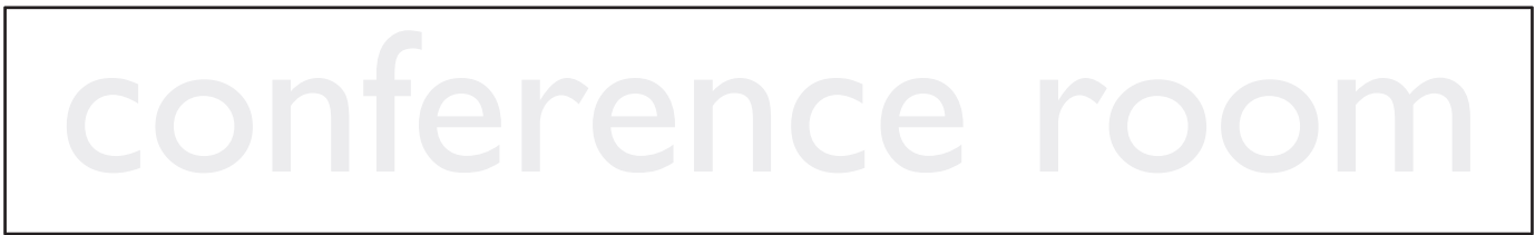
Figure 5. The text in this sign is compliant with the standards, since there is a measurable difference in lightness between characters and background.

related to the Michelson definition of luminance contrast: