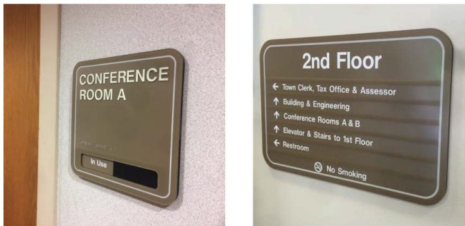
Figure 1. Examples of a designation sign (left) and a directional and informational sign (right).