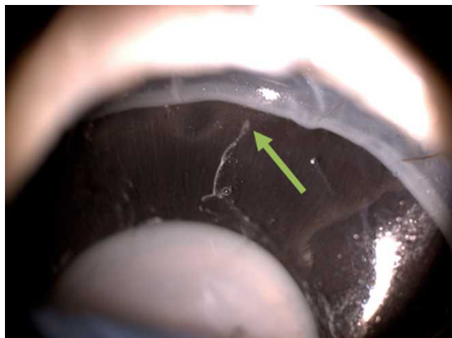
FIGURE 4. Slit-lamp photograph. Presence of delicate vitreous strands into the inner hole of the sclerotomy (arrow) was considered vitreous incarceration grade 1. Triamcinolone acetonide, which stained the intraocular residual vitreous, allowed us to visualize the incisional vitreous strands clearly.

The image sequences obtained were reviewed, and one snapshot from each sclerotomy was selected for presentation in a masked fashion to one of the authors (J.B.-H.) who classified the sclerotomies according to the grade of vitreous incarceration in the wound, in a similar manner to that previously described. 17 Grade 0 ( G0 ) was defined as absence of vitreous incarceration at the sclerotomy site (Fig. 3), grade 1 ( G1 ) was considered as the presence of delicate vitreous strands directed to the inner hole of the incision (Fig. 4), and grade 2