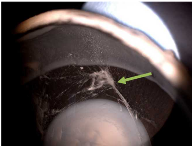
FIGURE 5. Slit-lamp photograph. Presence of thick vitreous strands into the sclerotomy (arrow) was classified as vitreous incarceration grade 2. Triamcinolone acetonide allowed us to visualize the incisional vitreous strands clearly.

(G2) was classified as the existence of thick vitreous strands aimed toward the sclerotomy (Fig. 5). The injection of triamcinolone acetonide, which stained the intraocular residual vitreous, allowed us to visualize the incisional vitreous strands clearly.