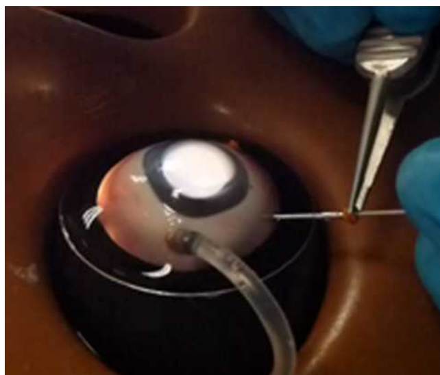
FIGURE 2. Superior cannula removed over the light probe.

After that, infusion pressure was lowered to 5 mm Hg and the superior cannulas were extracted following their oblique incisional pathways. In 59 randomly chosen eyes, the cannula used by the vitreous cutter during the vitrectomy was removed with the light pipe introduced through it (Fig. 2), and the cannula used by the illumination probe was taken out with the cannula plug inserted. In the other 59 eyes, the cannula used by the illumination probe during the vitrectomy