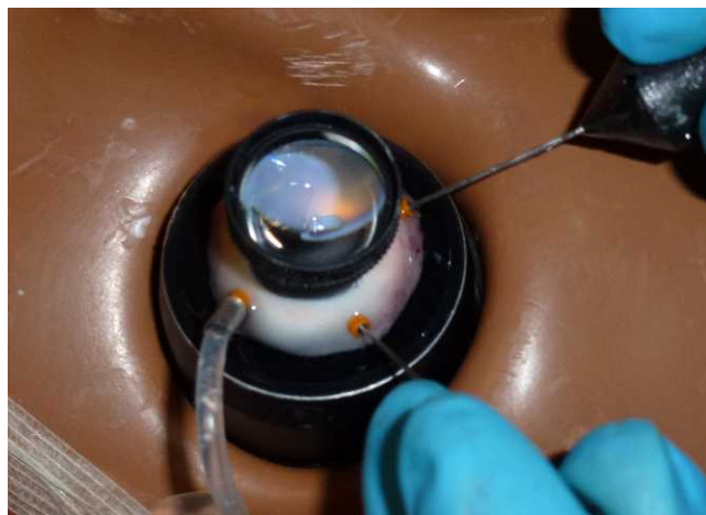
FIGURE 1. A 23-gauge vitrectomy performed in cadaveric pig eyes. Vitreous cutter and illumination probe are introduced through superior cannulas, placed 4 mm from the limbus.

vitrectomy have any influence on the degree of incisional vitreous incarceration, so a fixed pressure value was used. The pressure value was determined as that appropriate for performing vitrectomy in the pig eye. Vitrectomy was also performed inside both superior cannulas, and all around the vitreous cavity next to the inner tip of the cannula; we also reached each perisclerotomy area by inserting the vitreotome probe through the opposite superior cannula. After checking that balanced salt solution (BSS) flowed freely through both superior cannulas, the infusion line was clamped and 1 mL of triamcinolone acetonide 40 mg/mL (TrigonDepot, Bristol-Myers Squibb Company, Princeton, NJ) was slowly injected through the cannula used by the vitreous cutter, with the aim of staining intraocular residual vitreous. The infusion line was opened and all the free triamcinolone that was not adhered to residual vitreous was exchanged for BSS.