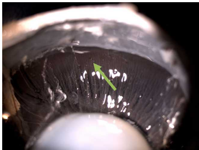
FIGURE 3. Slit-lamp photograph. Absence of vitreous strands in sclerotomy was defined as vitreous incarceration grade 0.

was removed with the light pipe introduced, and the one used by the vitreous cutter was extracted with the cannula plug inserted. In this way, we avoided the possible effect that the different manipulations exerted on the sclerotomies by the vitreous cutter or the illumination probe could have on postoperative vitreous incarceration. Finally, intraocular pressure was raised to 10 mm Hg (to slightly “harden” the eye), the infusion line was clamped, and the infusion cannula was taken out with the clamped infusion line inserted.