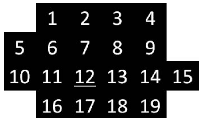
FIGURE 1. Micro Perimeter 1 stimulation grid on the central retina. These points were distanced 1° from each another. Stimuli were more represented in the right and inferior visual field (left and superior retina) with respect to the fixation point, which is underlined in the figure (point number 12).

The location of each patient's PRL was referenced to the fovea, and the distance and direction in millimeters were converted to degrees according to strategies described by others. 18,25,26 Fixation stability was previously defined in terms of the percentage of fixation points that fall within a 2°-diameter circle during the visual field test. We did not record fixation stability as the bivariate contour ellipse area because our study was planned and conducted before this measure proved to yield better correlation with RS than percentage 2° stability using MP1 microperimetry. 26