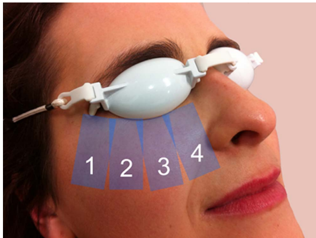
FIGURE 1. IPL treatment was applied to four periocular zones inferior to the eye, while the eyes were protected by opaque goggles. Both eyes received treatment, with a light-blocking filter applied to the tip of the E>Eye in the control eye.

Intense pulsed light devices contain high-intensity light sources, which emit polychromatic light extending from the visible (515 nm) to the infrared spectrum (1200 nm). The light is directed to the skin tissue and is then absorbed by the targeted structure, resulting in the production of heat ( >80^{\circ}\text{C} ), which destroys the pigmented skin lesions. Appropriate wavelengths can be selected for different targets depending on the absorption behavior and the penetration depth of the light emitted, and specific filters can be chosen to limit the delivery of wavelengths to the treatment area resulting in selective thermal delivery. 17,19