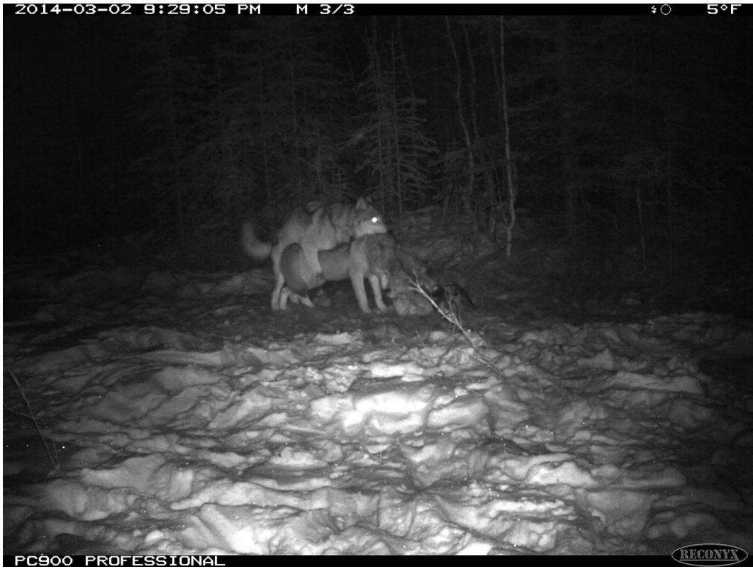
FIGURE 2. Suspected true hermaphroditic gray wolf ( Canis lupus ) 1306 mounting another wolf on 2 March 2014 in Denali National Park and Preserve, Alaska, USA.

incompletely extending over this organ. There was no evidence of a scrotum. Internally, there was a bicornate uterus with an enlarged uterine body (Fig. 1E, F), lacking a true cervix, instead widening into a vagina ending blindly past the base of the urinary bladder and not appearing to connect with the vulva (Fig. 1G, H). The urethra extended into the external genitalia. A small bulge corresponded to the typical location of a prostate in the pelvic inlet.