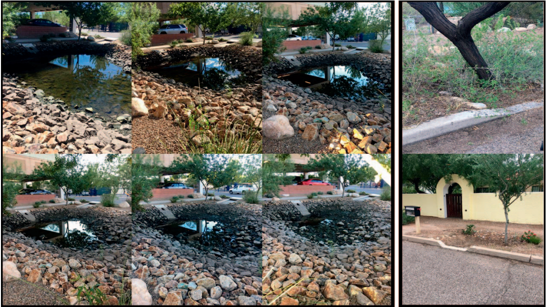
Fig. 2. Images of the green stormwater infrastructure sampled in 2018: 6 days post-rain event of the basin that retained water and produced mosquito larvae (left 6 images) and 2 examples of curb cuts that did not retain water (right 2 images).

mentation (Staddon et al. 2018). Successful implementation of an urban greening initiative requires collective responsibility by all concerned parties (Paul et al. 2014).