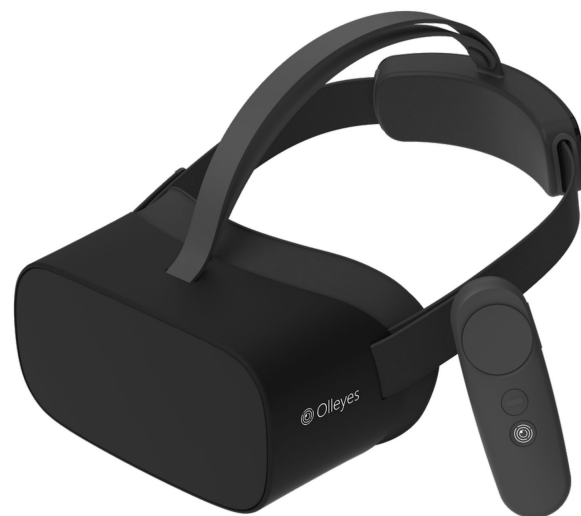
Figure 1. The VisuALL head mounted device (HMD) and Bluetooth connected handpiece.

The hardware includes three main components: a head mounted device (HMD) also known as a VR headset (Fig. 1), a web-capable device (laptop, phone, or tablet) and a Bluetooth connected handpiece (see Fig. 1). The HMD is powered by Pico (Pico Interactive, Inc., San Francisco, CA). It weighs 276 g and includes a Quad High Definition Liquid Crystal Display with a resolution of 3840 × 2160 pixels and a refresh rate