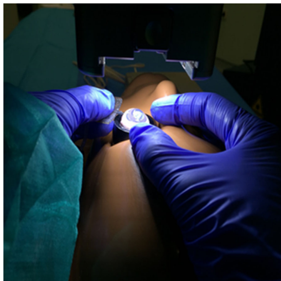
Figure 1. Placement of the eye on a specific holder with sufficient support to withstand the experiment.

The study was performed in accordance with the ARVO Statement for the use of animals in Ophthalmic and Vision Research. Freshly enucleated porcine eyes were used to measure the IOP during the whole surgical time. All eyes were free of corneal damage when inspected by slit-lamp microscopy. Before starting with the measurement, all eyes were inflated with a 5% glycosylated solution through the optic nerve (a method previously described by Kasetsuwan et al.) 12 to obtain an IOP between 10 and 30 mm Hg, that was checked by Perkins appplanation tonometry. Then, the eyes were placed on a specific holder with sufficient support to withstand the surgical procedure (Fig. 1).