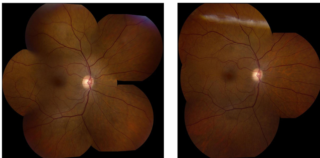
Figure 1. A montage of individual images using the 7-field protocol ( left ) and the 4-widefield protocol ( right ). The area of retina covered in the image is similar between the two imaging protocols. The difference is in additional nasal field coverage in the 4-widefield protocol.

The Diabetes Prevention Program Outcomes Study (DPPOS) is a clinical study investigating the long-term effect of lifestyle and metformin interventions in the Diabetes Prevention Program (DPP). 9–11 The DPP was a multicenter randomized controlled trial that enrolled 3234 adults at high risk of developing type 2 diabetes between 1996 and 1999. DPP enrollment was based on having impaired glucose tolerance (plasma glucose 140–199 mg/dL after a 75-g oral glucose load), elevated fasting blood glucose (fasting plasma glucose 95–125 mg/dL), and elevated body mass index. Participants were randomly assigned to placebo ( n = 1082 ),