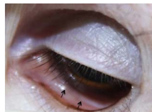
Figure 1. Representative external eye picture showing the microrod implanted in the subconjunctival space (arrows).

The biodegradable random copolymer used as the matrix material was PLC (Purac Biochem BV,