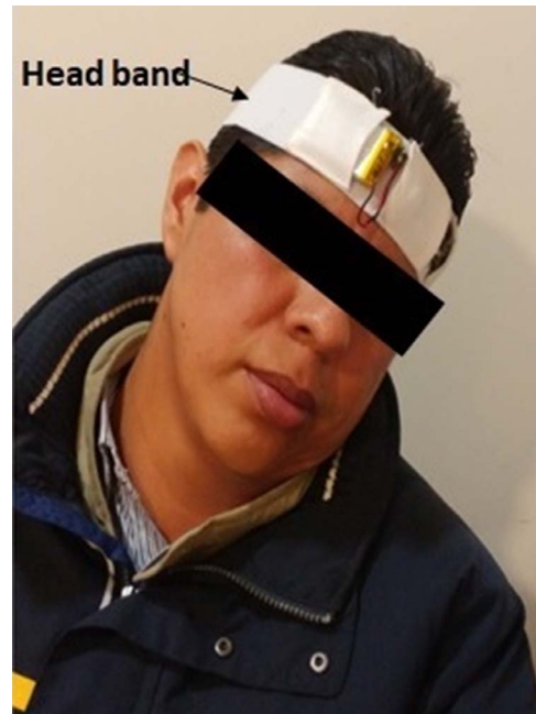
Figure 2. Rechargeable 3.7V lithium polymer battery as power source. The Figure shows the placement of the headband with the device over the left eye.

Once the headband was secured in place, the physician manually placed the patient's head in the proper position and restricted all movement for the next 5 minutes. During this time, the device registered a primary position from where all deviation were recorded. Then, the patient was sent home with precise written instructions about proper head position. The proper topical antibiotic therapy was administered to the patient and he/she was advised not to take the headband off (Fig. 2). Written instruction included the following: A prescription for the eye drop drugs, (including common adverse