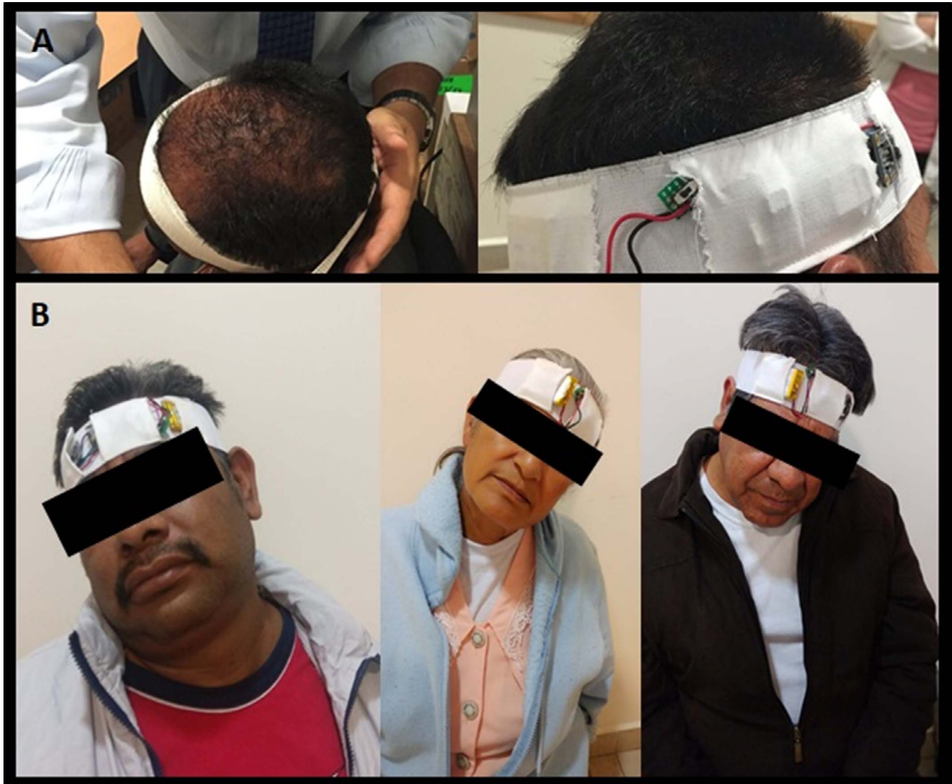
Figure 3. Head positioning tracking device. (A) Placement of the headband and primary position registry. The Figure also shows a lateral view of the position sensor placed over the right eye. (B) Primary position recording in three patients. The patients will then be sent home and asked to return in 24 hours. From left to right , pictures correspond to patients 2, 6, and 5.

time in which the patients held their heads within an acceptable position and the total time in which the patients had a significant deviation from the primary head position ( P < 0.001 ). Regarding each individual axis, there was a significant difference in the number of hours with an acceptable position and the hours with a significant deviation on the Y-axis ( P < 0.003 ). There was no difference between the X and Z axes.