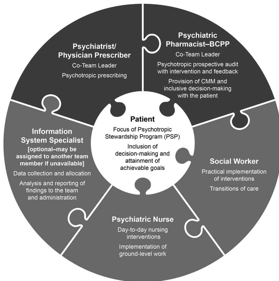
FIGURE 2: Psychotropic stewardship team accountability

balancing limited resources. Initiation of a stewardship program may focus on high-risk medications, patients with documented medication nonadherence, patients with comorbid medical diagnoses, or high users of health care resources. There is limited evidence on specific criteria or risk stratification strategies to identify patients who would most benefit from a PSP. Table 3 provides examples of potential patient criteria PSPs could use to identify appropriate patients. Those patients meeting multiple criteria could be prioritized if necessary.