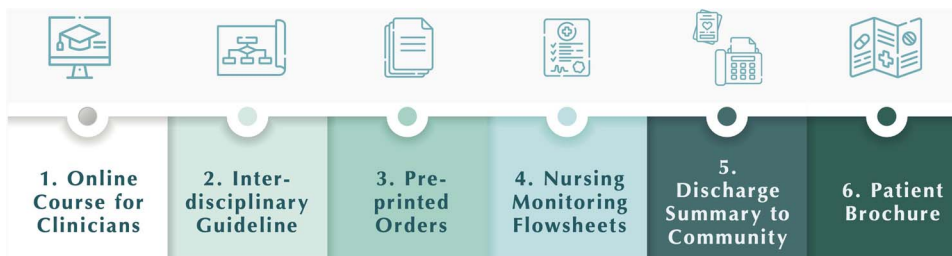
FIGURE 2: Clozapine clinical toolkit components