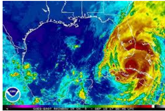
Figure 2. Hurricane Irma path toward Florida, 09SEP17 (source:

Irma's wind field expanded dramatically as it approached Florida, with tropical force winds extended outward to ~400 miles and hurricane force winds ~80 miles from its center. Storm surge flooding combined with long periods of heavy rain and strong winds to buffet much of Florida's coasts, particularly in the Keys and within ~ 12 hours, Irma had subsided and made its way up Florida towards Georgia and South Carolina (NWS2019).