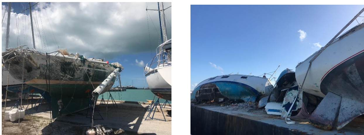
Figure 9. Examples of damaged hull conditions

Managing the response through the use of ICS was important although a bit challenging. For a response that is primarily a salvage operation, how best to organize the various components such as where in the ICS organization to put the Salvage members can be a challenge and needs to be thought through carefully, and ICS is flexible enough to be able to support any response. Also, it was important to bring in experienced responders well-versed in ICS from other Navy organizations outside of the area as those members working and living in Key West had all been affected by the hurricane, and needed to focus on taking care of families and home life as well as continuity of operations for NASKW as a whole. To be able to have a trained, experience team of ICS practitioners come in from out of area to help manage the response was key to its success.