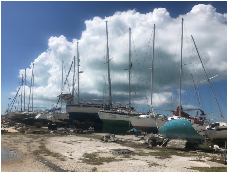
Figure 8. Displaced vessels in temporary storage at NASKW Truman Annex; partial hull remains of one vessel in foreground (source: Author).