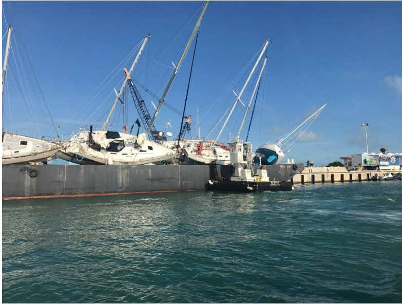
Figure 7. Hurricane-displaced recreational vessels retrieved onto salvor's barge, being brought back to NASKW Truman Annex for temporary storage (source: Author).