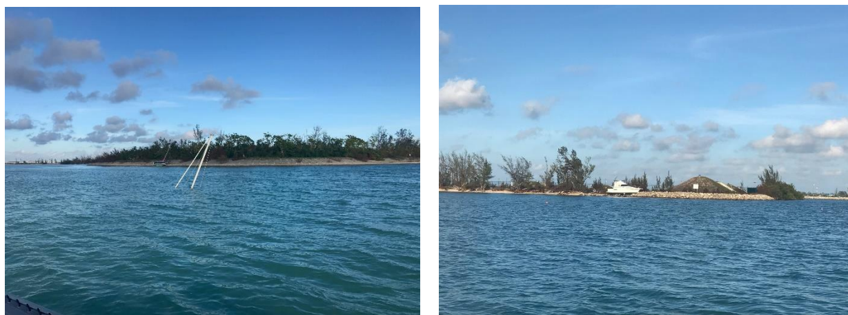
Figure 6. Sunken, partially-submerged and stranded recreational vessels on Navy property, post-Irma.

A total of 80 recreational vessels were located throughout NASKAW property, either sunken or partially submerged, or stranded on the shore.