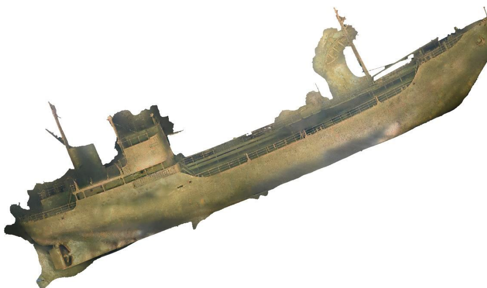
Figure 2. In-situ image of the shipwreck Lindesnäs produced using photogrammetry.