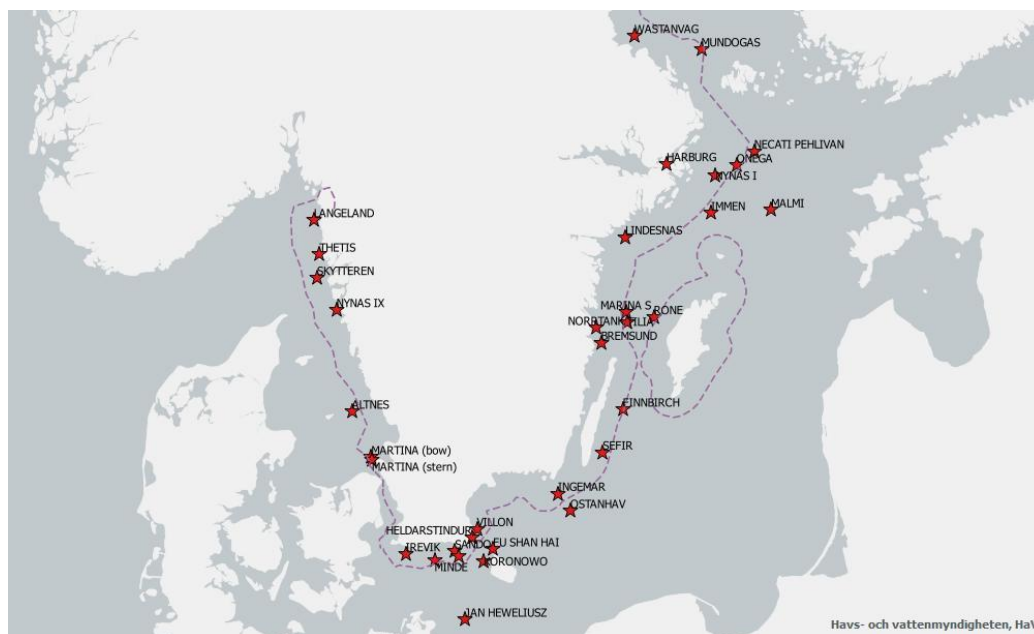
Figure 1. The 31 shipwrecks that is included in the national program.