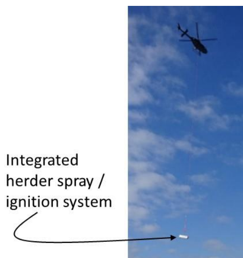
Figure 3. Combined herder spray and ignitor system slung from a helicopter.

Based on the recommendations from the 2015 testing in Fairbanks, work to develop a combined herder delivery / slick ignition system capable of being flown in a single helicopter began in 2016. The result was a slung load igniter system (Figure 3) that was connected to a reservoir of herder located in the cabin of a helicopter (DESMI Ro-Clean, 2017). A nozzle was located on the ignitor body to allow spraying herder. Developers found a couple of issues with the system during testing. First, the slung load positioning kept the helicopter from reaching maximum speed. This limits both response speed and range. Another issue was that the individual ignitor design of the system did not balance the amount of herder. That is, much more oil could be herded than could be ignited. Issues with the combination slung-load ignitor / herder delivery system led to it being scrapped, and the effort to develop a completely new system began.