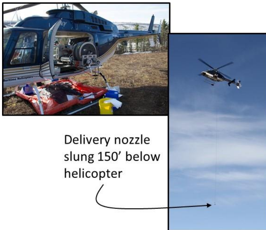
Figure 2. Photos of the prototype helicopter herder delivery system in the cabin of a helicopter (left image) and deploying the 150' hose and nozzle assembly during flight.

A new joint-industry / government project was initiated to continue development of the herder delivery / ignition system. The Prince William Sound Oil Spill Recovery Institute (OSRI) in Cordova, Alaska is leading this effort. Participants in the project include OSRI, ExxonMobil, and the U.S. Bureau of Safety and Environmental Enforcement. The project team has contracted with a vendor that primarily develops equipment for the U.S. Department of Defense, Tactical Electronics, to evaluate the existing technologies and recommend potential improvements or new approaches. This paper describes efforts by the project team to develop an aircraft-deployable system capable of delivering and applying herder to surface slicks and then igniting a herded slick.