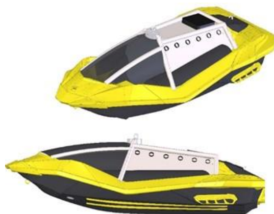
Figure 5. Conceptual drawing the unmanned surface vehicle (120”x46”x24” height; approximately 400 lbs).

topsides to be removed and replaced with a custom-made topsides with the capabilities needed for our application. Figure 5 shows a conceptual drawing of the RSV.