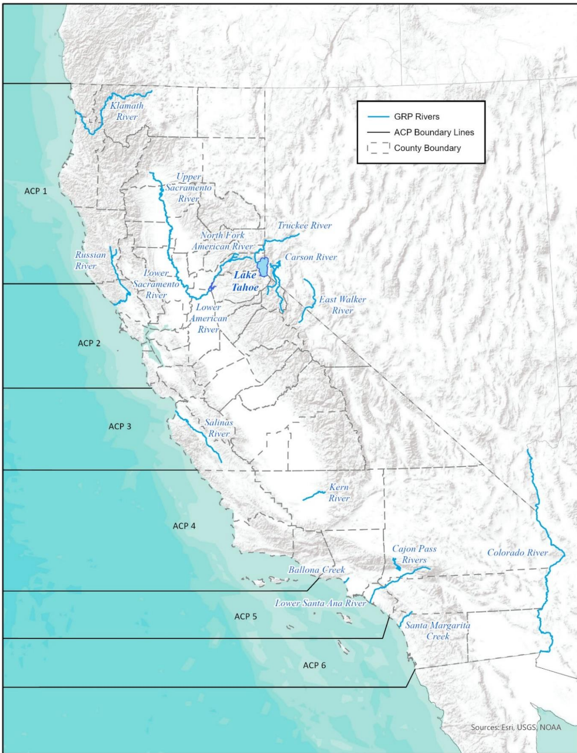
Figure 2. Statewide ACP and GRP coverage