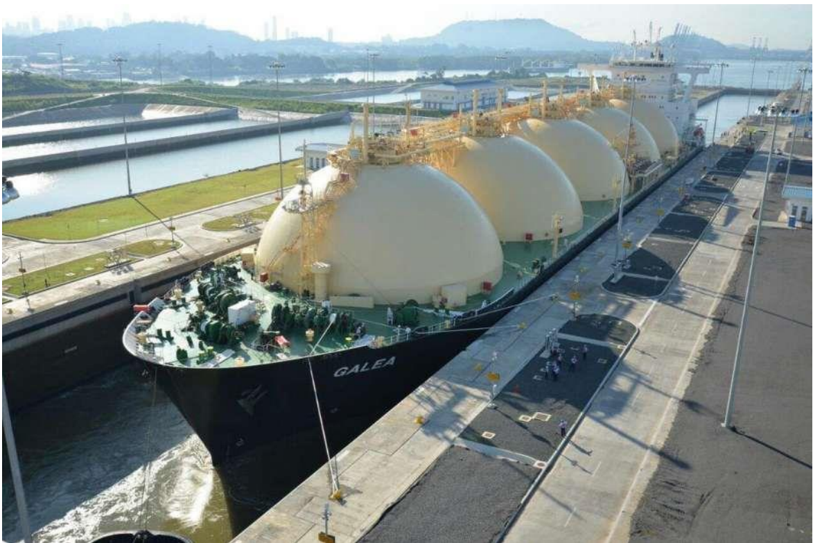
Figure 3. LNG tanker in new expanded lock.

Prior to this expansion, liquefied natural gas (LNG) was not carried through the Canal primarily because most LNG carriers were post-Panamax size ships. The expansion project coupled with the United States energy renaissance and expected emergence of LNG exports from the US make the Panamá Canal a key maritime resource to reduce time and cost of transit to markets in the Pacific. Once the Canal expansion project was completed, the new lock system and Canal waterways became large enough to accommodate most LNG carriers.