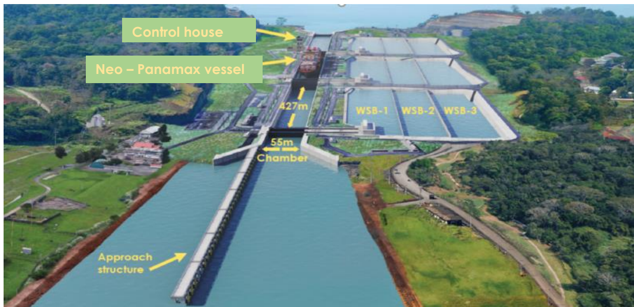
Figure 2. Panamá Canal expansion project illustration.

Downloaded from http://meridian.allenpress.com/ios/article-pdf/2021/1/688672/2980664/12169-3358-2021-1-688672.pdf by guest on 26 January 2022