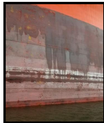
Evidence of contamination on a ship that recently had cargo offloaded.

Throughout the initial few weeks of the response, there were as many as six decon teams in charge of decontaminating commercial vessels that needed to transit the Houston Ship Channel, which included a roving decon team that would decontaminate priority vessels. Priority was given to vessels contaminated that were in port when the release happened. Hot water pressure washers were the main means of decontamination. Local Houston Fire Department boats with high pressure water hoses were also utilized for vessels than transited into product with cargo on board, but then were offloaded were significantly higher, leaving a contamination film in hard to reach/higher freeboard. Additionally, there was a dedicated decon team that could decontaminate a vessel while in-transit through the Houston Ship Channel, during which wash-off could be contained with sweeping boom behind the vessel. All teams and the Branch Director initially had their APR on-person, but after benzene levels decreased following the initial emergency response, the need for APRs also decreased.