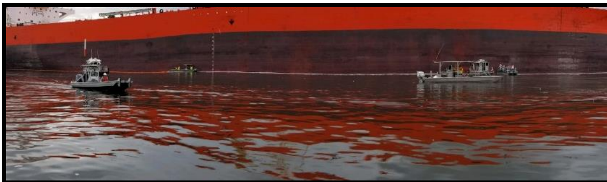
A roving decontamination team in action.

was evident and difficult to track at times, which resulted in suspended operations to reduce responder's exposure potential.