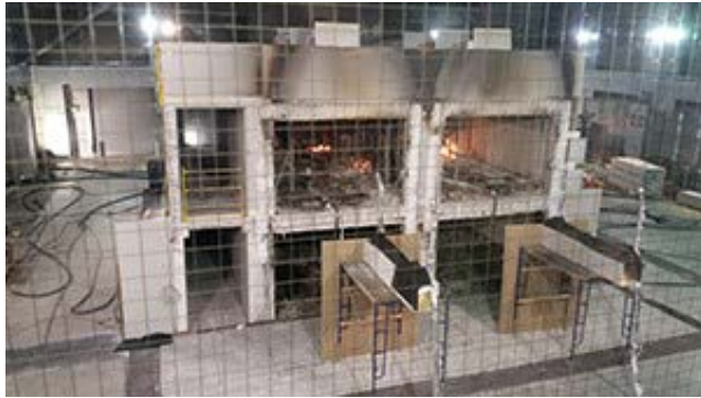
Five fire tests were conducted on this full-scale multistory mass timber apartment building as part of the Ad Hoc Committee on Tall Wood Buildings research into the feasibility of incorporating new construction types into the model building codes.

of the ANSI/APA PRG 320 CLT manufacturing standard (APA 2018).