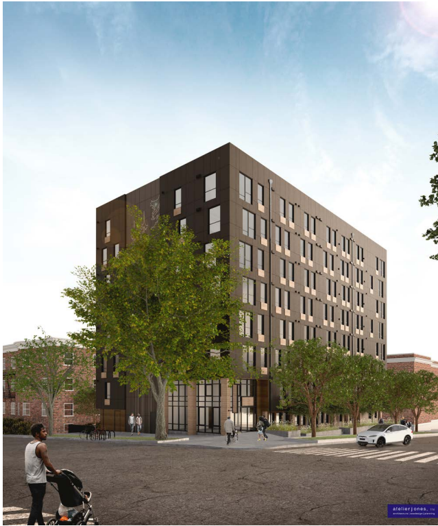
A rendering of the 67,000-square-foot mass timber affordable housing project in Seattle that received support from a U.S. Forest Service Wood Innovation Grant for Community Roots Housing. The team is comprised of atelierjones, Skipstone Development, Swinerton Construction, Timberlab and DCI Engineering, and Dali Development.

fire performance of adhesives used to make CLT since the ATF tests were studied, and this additional research would test that performance. AWC contracted with the Research Institute of Sweden (RISE) to perform several fire compartment tests, each with progressively more exposed mass timber surfaces. The results were compelling and suggested that fires in compartments with fully exposed ceilings would self-extinguish. Based on the RISE report (Brandon et al. 2021), several members of the former ICC TWAH committee developed a proposed code change to the 2024 IBC with the support of AWC. The change was considered during the 2021 Group A code development hearings and approved by the ICC membership later that same year. Previously, mass timber buildings of Type IV-B, or up to 12 stories, construction were permitted to have a ceiling area exposed of no more than 20 percent of the floor area and the remainder protected with gypsum wallboard. Beginning with the 2024 IBC, ceilings areas in Type IV-B can have up to 100 percent of the floor area as exposed mass timber. This new provision will not only reduce construction costs but will also lower the carbon footprint of mass timber construction by not requiring the use of carbon intensive drywall.