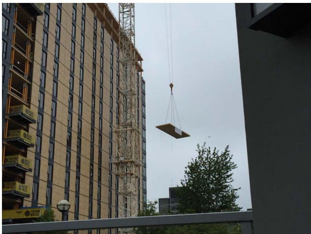
A panel is being lifted into place during construction of the 18-story Brock Commons Tallwood House student residence at The University of British Columbia.