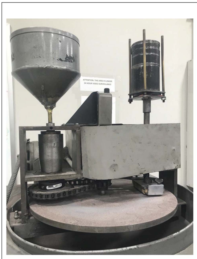
Figure 2.—Navy-type wear tester used to conduct abrasion test.

where MC is moisture content (%), W_{in} is initial weight (g), and W_{od} is oven-dried weight (g);