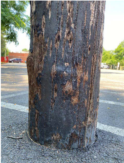
Figure 2. —Approximately 75-year-old creosote-treated pole in parking lot in Vienna, Virginia.

Creosote treatment of poles is widely available in the United States and the many plants transitioning away from pentachlorophenol can shift to creosote treatment with little investment. Availability is further enhanced with creosote treatment because it can be used for southern pine and Douglas fir. Creosote-preserved poles remain climbable by linemen because creosote seals and lubricates the wood fiber so that flexibility in the wood surface is retained. Current treatment practice and standards assure that the surface of poles has only minimal residue of creosote and is much cleaner than in past decades.