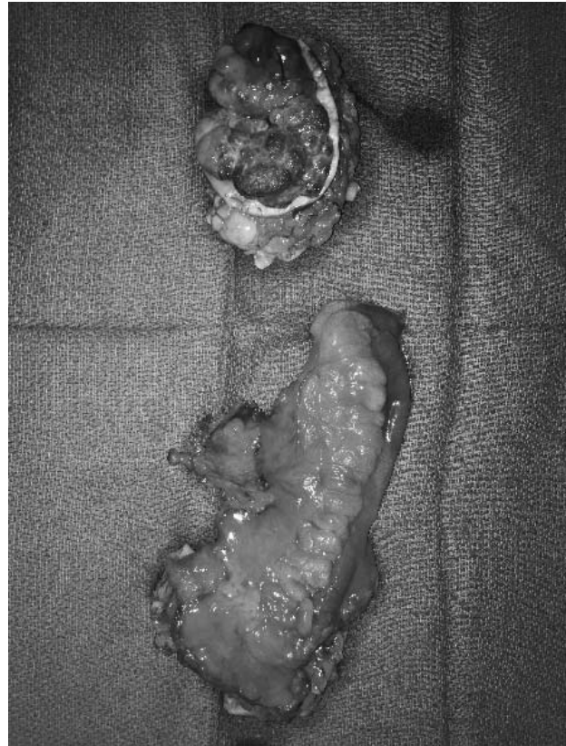
Fig. 2 Adenocarcinoma specimen.

The patient had yearly follow-up appointments that were unremarkable. She presented in December 2015 with a 2-month history of a “lump” next to her ileostomy with difficulty keeping the appliance in place, a foul odor, and bloody ileostomy output (Figs. 1 and 2). A biopsy was done in the office confirming a well-differentiated adenocarcinoma. A computed tomography (CT) scan demonstrated a large parastomal hernia and an ill-defined oblong infiltrating mass in the small bowel mesentery measuring 11 cm in length and 3 cm in diameter, consistent with a desmoid tumor.