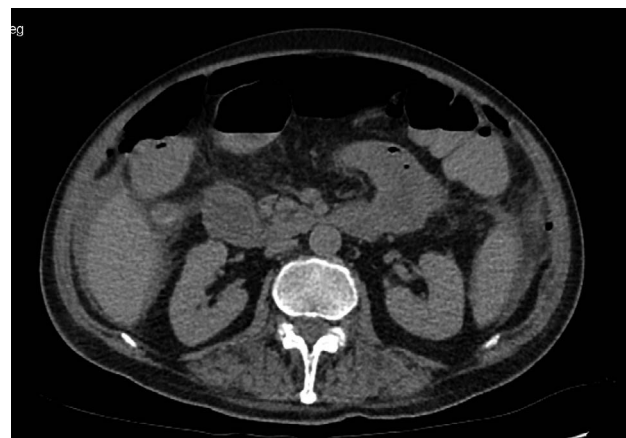
Fig. 1 CT showing free intraabdominal gas.

Histopathology of the colon showed inflammation at the site of perforation of the transverse colon with lymphocyte and neutrophil infiltration. Thrombosed vessels with angioinvasive fungal elements were identified on hematoxylin and eosin (H&E) staining (Image 2) and Grocott's methenamine silver (GMS) staining (Fig. 2). The fungal hyphae had acute angle branching with septation, suggestive of Aspergillus . Abundant fungal elements were seen within the ulcer slough at the site of perforation, suggestive of ischemic perforation secondary to fungal thrombi. There was no hematologic and immunohistologic features suggestive of relapse of leukemia (normal distribution of CD3, CD5, CD10, CD20, CD21, CD23, CD43, CD 79a, cyclin D1, bcl2, bcl6).