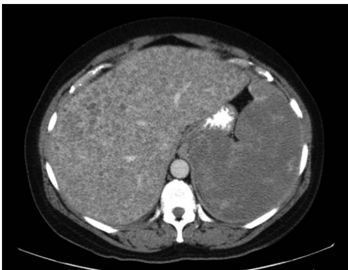
Figure 1. Computed tomography images revealed multiple small, low-attenuating lesions throughout the enlarged liver and spleen.

pale eosinophilic cytoplasm with poorly defined cell borders, pleomorphism, hyperchromatic nuclei, and increased mitotic activity. Immunohistochemical stains were positive for factor VIII-related antigen and cluster of differentiation 31 (CD31). The pathologic diagnosis