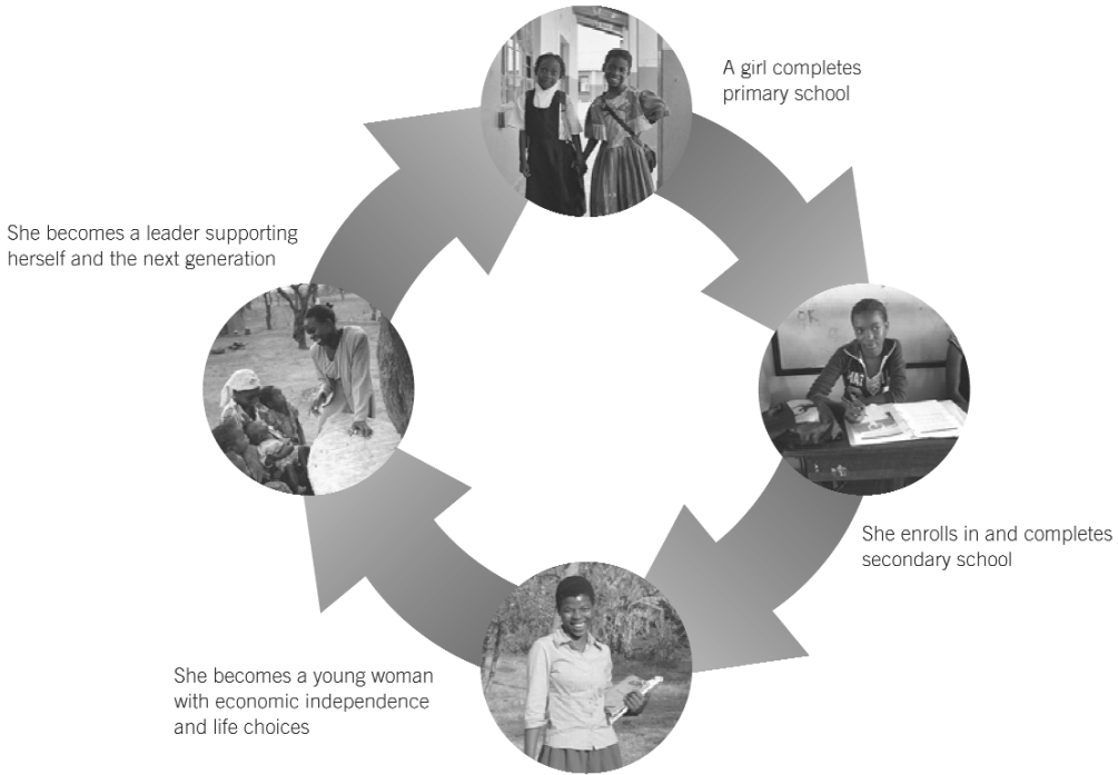
Figure 1. The Camfed Program Cycle.

strategic plans of the overall organization. They are given free licence to question: Is the organisation being true to its values? Is it accessing the correct, and sufficiently balanced, funds? Is the organization acting in the best interests of the girls it is seeking to serve? Is the long term future of Camfed secure?