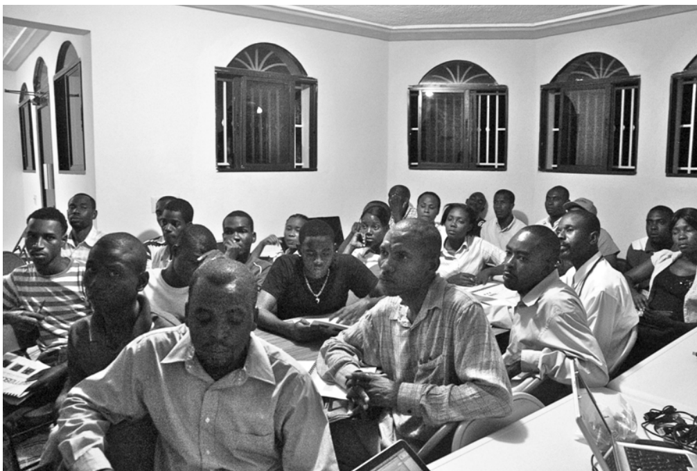
Workers at the 1000 Jobs/Haiti-Samasource in Mirebalais.

gorization system. They contacted CrowdFlower, a crowd-sourcing company based in San Francisco, to host the translation process. Samasource, a nonprofit outsourcing firm, stepped in to provide training to a local Haitian workforce to meet the additional demand for translation services.