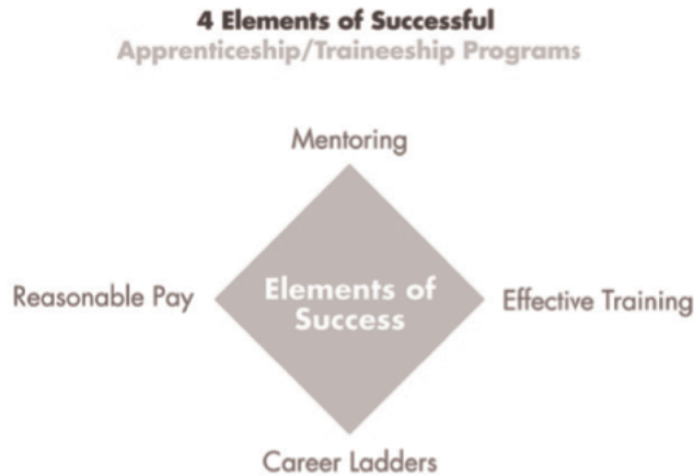
Figure 2: Four Elements of Successful Apprenticeship