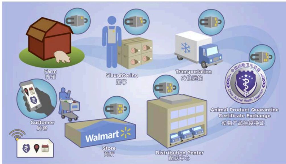
Figure 2. Pork Supply Chain in China

pinpoint and remove a product from the shelves immediately after becoming aware of a food safety issue could prevent illnesses, and also reduce the likelihood that the wrong sources will be erroneously implicated.