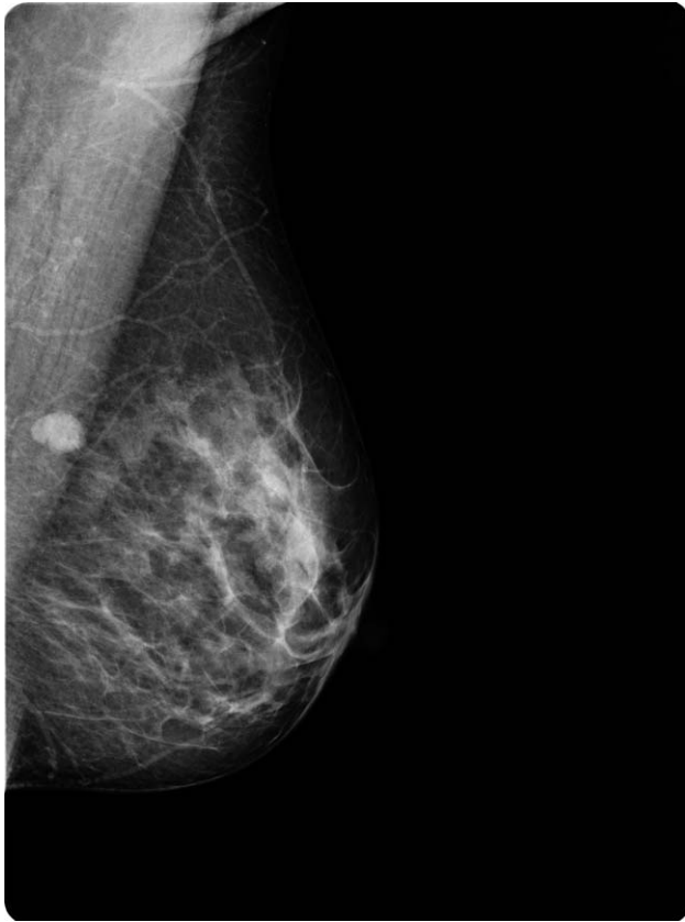
Fig. 1 Left mammography identifying a solid, smooth nodule in the upper internal quadrant.

tion cytology (FNAC) revealed malignancy (grade C5) (Fig. 3A and 3B). Quadrantectomy with sentinel lymph node biopsy was carried out. Histopathology revealed high-grade neoplasia with focal clear cell features and without ductal or lobular in situ components, which suggested metastasis from an extramammary neoplasm (Fig. 3C and 3D). Nevertheless, at immunohistochemistry only E-cadherin and pancytokeratin were positive, and a primary tumor could not be defined. Therefore, a full-body computed tomography scan was performed, and it showed a 50×80-mm left renal mass, multiple liver nodules, para-aortic lymphadenopathies, and a 22-mm pericardial lesion. The patient underwent palliative care and died after 4 months.