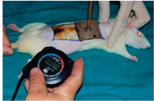
Fig. 1 Creating a third-degree burn with a brass plate.

Multi-drug resistant Pseudomonas aeruginosa strains ( 1 \times 10^8 ) isolated from 10 burn patients who were followed at the Baskent University Faculty of Medicine Burn Unit between 2008 and 2009 were used. Only one clinically significant Pseudomonas aeruginosa isolate from each patient was included in the study. The frozen bacterial solutions were subcultured on blood and EMB (eosin methylene blue) agar plates. After then the colonies were subcultured onto appropriate agar mediums for identification. The plates were incubated at 37°C in ambient air for 16–18 hours. The bacteria were identified to the genus level by conventional methods using an automated system. The fluid obtained through this method, which contained a colony of 1 \times 10^8 multi-drug resistant Pseudomonas aeruginosa in every 0.5 mL, was administered to the