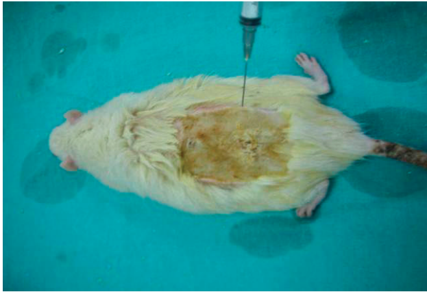
Fig. 2 Showing Pseudomonas colonies on the burned surface.

burn site was closed with sterile gauze. The burn sites of the rats in group 3 were secured with sterile gauze, preceded by the administration of Bactigrass. Citric acid was poured through a sterile injector over the burn sites of the rats in group IV, followed by closure of the burn site with sterile gauze. Acticoat was placed over the burn sites of the rats in group 5, followed by closure of the burn site with sterile gauze. Acticoat was soaked with distilled water three times per day. All dressings were fixed using a skin stapler. Dressings in all groups were changed once at the same hour every morning under anesthesia in all groups. The agents used in treatment were administered as appropriate for burn surface area. Appropriate anesthesia was achieved using the aforementioned anesthetic agents. On day 7 of the post-procedure follow-up, blood cultures were taken using samples from the left ventricle, and tissue cultures were taken from the burn site (quantitative), paravertebral muscles (quantitative), and lungs (quantitative) to evaluate the efficacy of the administered topical antimicrobial agents and bacterial translocation. Cultures were assessed in the microbiology laboratory and were calculated as 10^x colonies per gram of tissue. Growth of bacteria >10^4 cfu (colony forming unit) were considered significant. Biopsies were obtained in an attempt to evaluate the histopathologic degree of the burns. All rats were sacrificed at the end of the procedure.