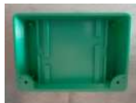
Figure 1. Tank Prototype

The stock oil droplet media consisted of 8ml mineral oil with 1ml toluene and 1ml naphtha and 40mg Sudan black B to enhance visualization. The oil-water-surfactant emulsion consisted of 40uL of the stock oil droplet medium with 10ml 1% Tween-20 a nonionic surfactant; vigorously agitated this produced a rich suspension of microscopic oil droplets ranging in size from 10 \mu -50 \mu (Figure 3).