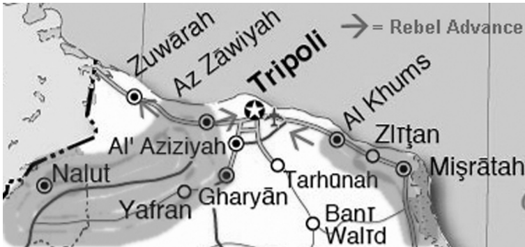
Figure 4. Rebels Converge on Tripoli after Five Months of NATO Intervention