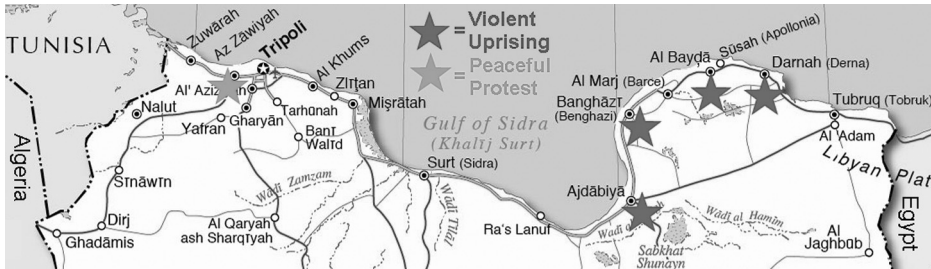
Figure 1. Rebellion in Eastern Libya, February 15–19, 2011