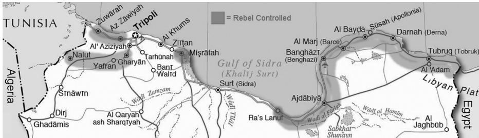
Figure 2. High Point of Initial Rebellion, March 5, 2011