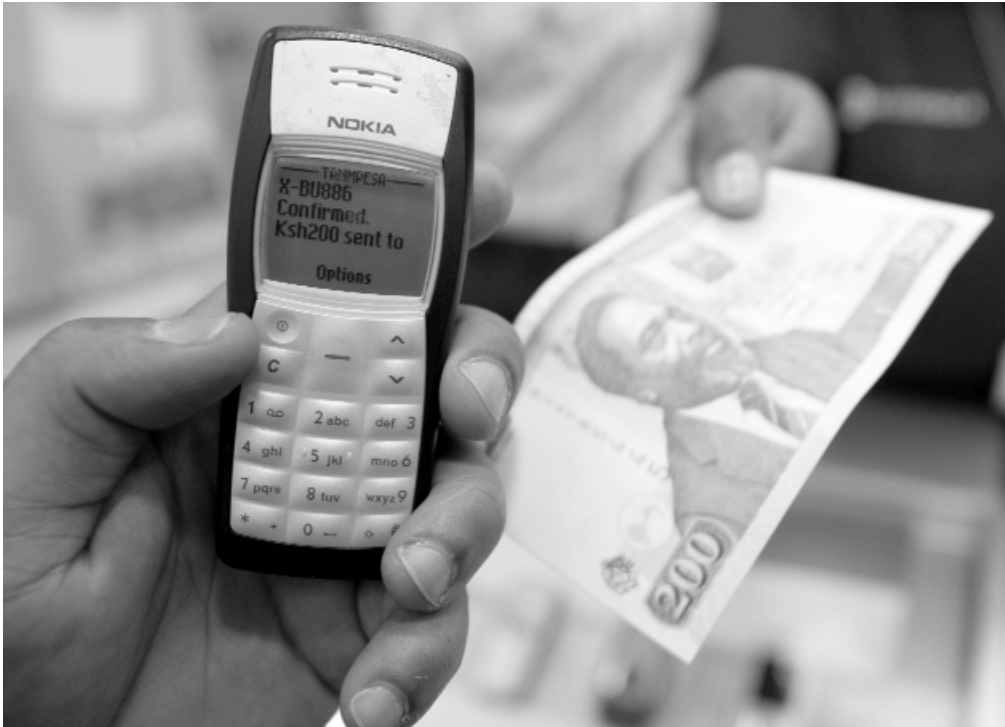
Figure 1. M-PESA screenshot.