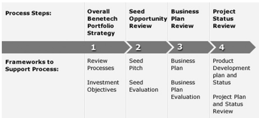
Figure 2. The Benetech Project Pipeline.