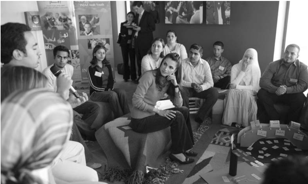
Regional Ambassador of INJAZ al-Arab Queen Rania Al-Abdullah of Jordan in a session with INJAZ students.

as Junior Achievement's ambassador: drumming up support at the Young Arab Leaders gathered in Dubai; launching INJAZ in Kuwait, where she grew up and is considered a beloved daughter; encouraging Arab first ladies to support INJAZ in their own countries; and rallying powerful business leaders from East and West at the 2008 World Economic Forum in Davos, Switzerland, to join INJAZ al-Arab's campaign to Empower One Million Arab Youth a Year by 2018. She really meant it when she told INJAZ students and supporters in Kuwait, "It is my dream to see the flag of INJAZ waiving high in every Arab city!"