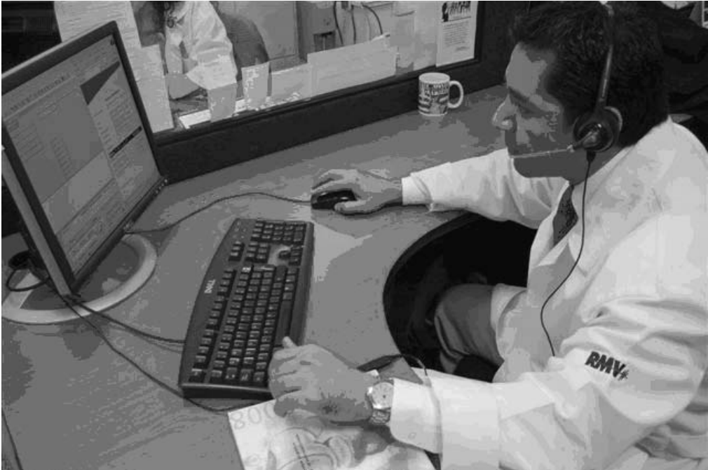
Figure 1. A doctor answering calls at MedicallHome in Mexico.