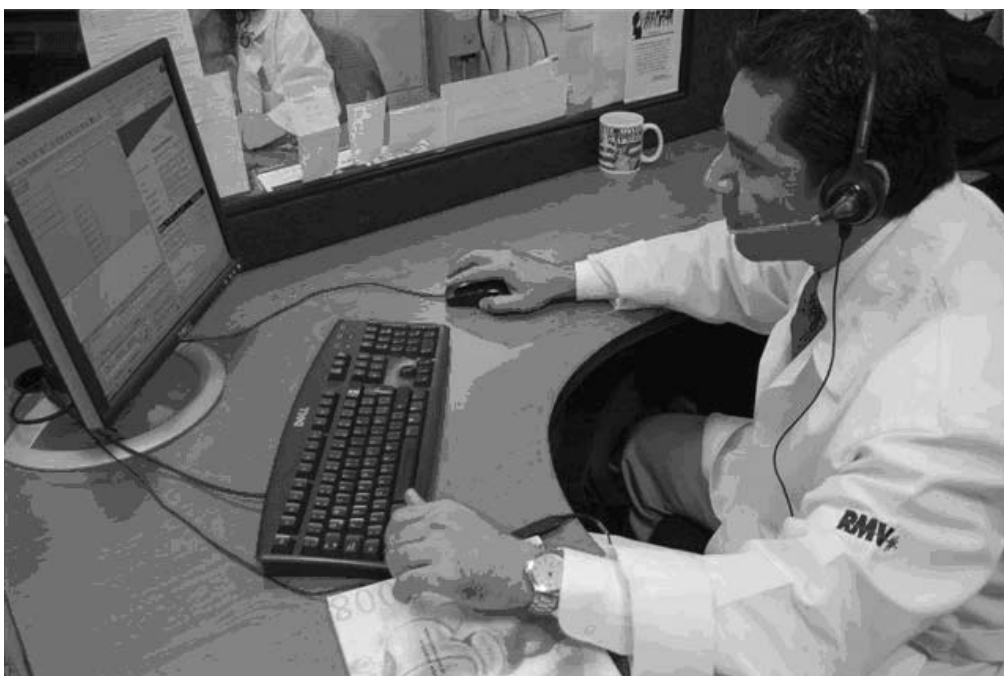
Figure 1. A doctor answering calls at MedicallHome in Mexico.