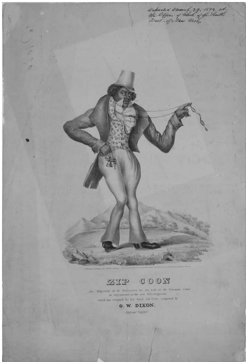
Figure 2 Cover for the “Zip Coon” sheet music published by Thomas Birch, New York, 1834