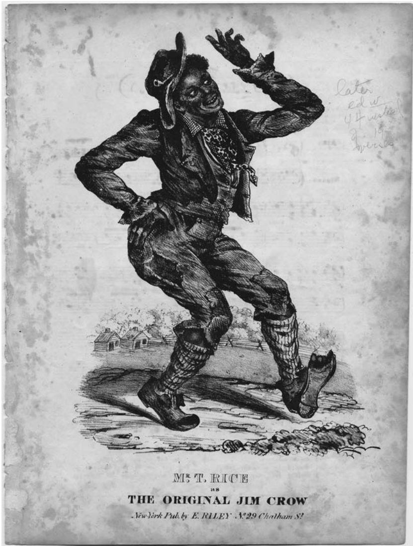
Figure 1 Cover for the “Jim Crow” sheet music published by E. Riley, New York, ca. 1831

of Blacksound are captured by Johnson in the following passage, which highlights what is at stake in the performance and construction of race by individuals within larger systems of power: