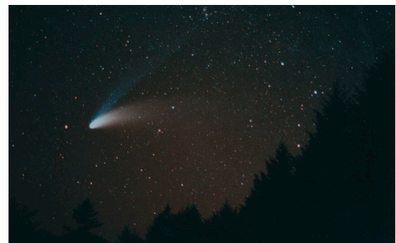
Hegde spotted the comet Hale-Bopp at perihelion while stargazing on his birthday.

“Mislocalization of very small amounts of prion protein... can be very detrimental.”