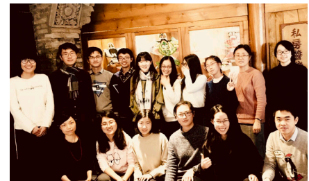
The Song laboratory in an old Beijing-style restaurant in spring 2018.