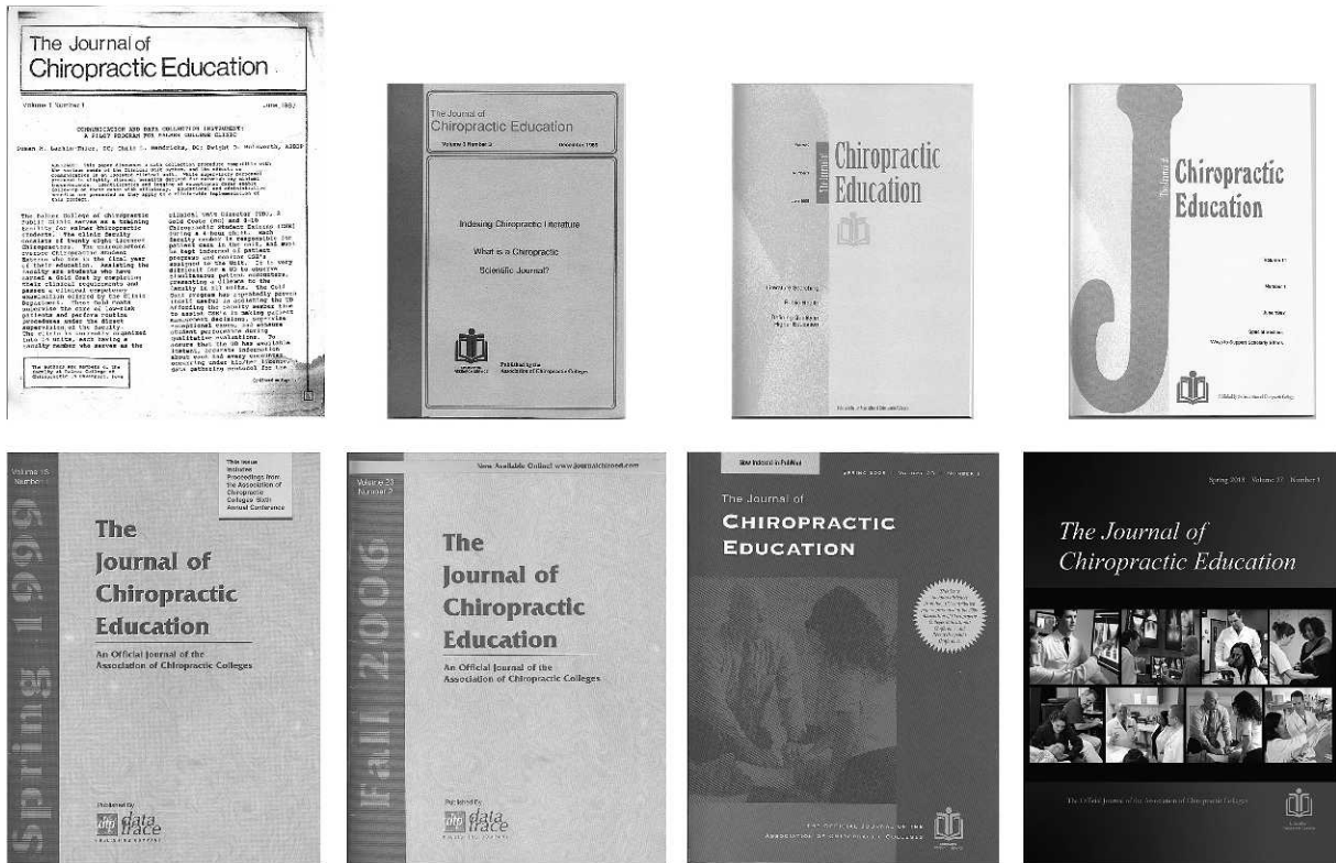
Figure 3 - Upper left to right: the inaugural issue of the JCE (1987), the first bound issue printed in the colors forest green and silver in the year that the ACC assumed ownership (1989), the year of the chiropractic centennial (1995), cover during the final year of the first editor Dr Grace Jacobs (1997). Lower left to right: format changed to a full paper size (1999), the year the journal first provided electronic access (2006), the covers include a symbolic image of a chiropractic teaching moment and announce the inclusion of the journal in PubMed (2009), the cover in full color with multiple teaching moments representing the spirit of chiropractic education (2013).