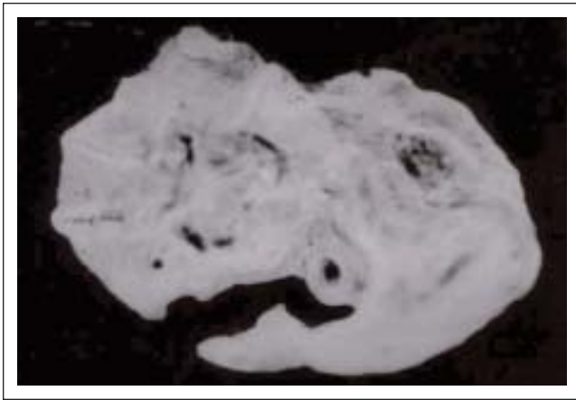
Figure 4. The bottom surface of the cusp after the application of the self-curing acrylic resin.