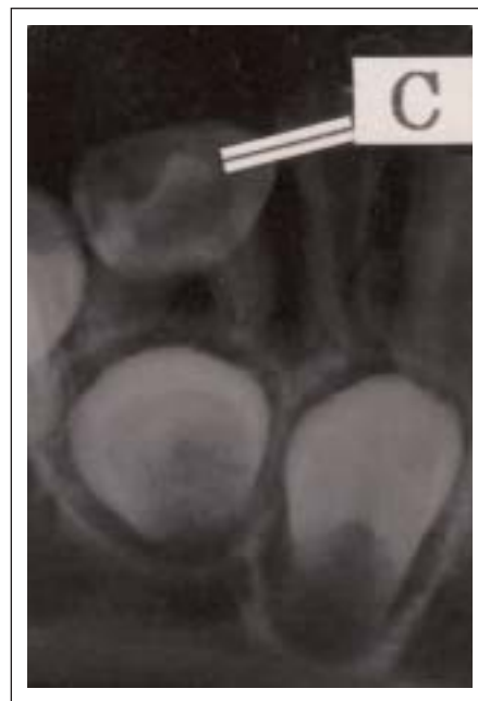
Figure 2. Radiographic appearance on presentation. C: central cusp.