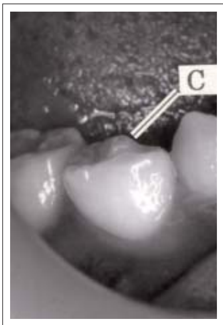
Figure 1. The appearance of the central cusp on initial presentation. C: central cusp.