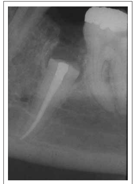
Figure 5. Post-operative radiograph.

tissues not affected by Usher's Syndrome like the sub maxillary gland, spleen, testis, oviduct, epididymis, large and small intestines. 6