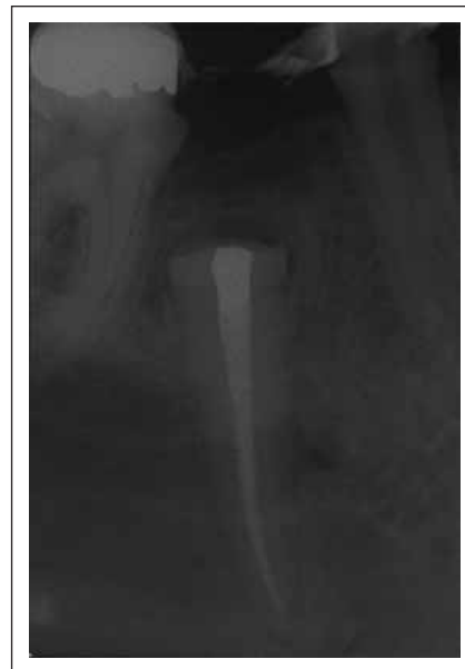
Figure 7. First recall six months later.

Clinically missing tooth #20 was detected on panoramic radiograph located inside the mandible. The patient was referred to the Oral and Maxillofacial Surgery department for evaluation and treatment of the impacted tooth with a tentative diagnosis of small follicular cyst/dentigerous cyst. The oral surgeon did not extract #20 due to increased risk of fracturing the jaw and traumatizing the mandibular nerve.