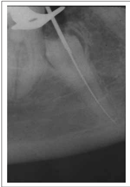
Figure 3. Guide file radiograph.