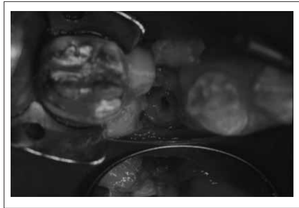
Figure 2. Surgical endodontic access.