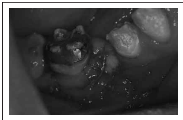
Figure 9. Sutures after procedure.

Periapical and occlusal radiographs were taken.