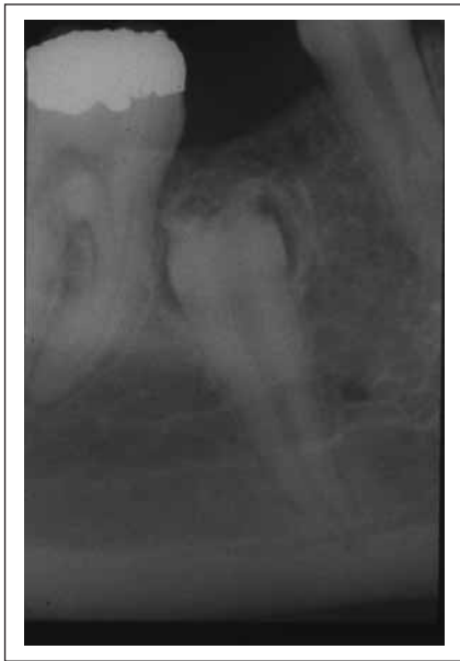
Figure 1. Pre-operative radiograph.