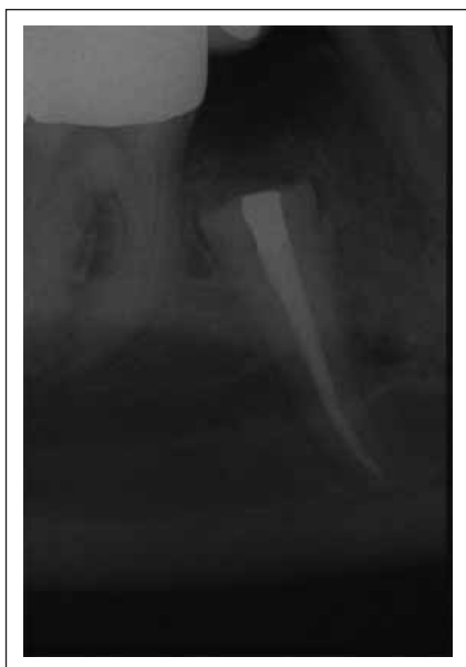
Figure 8. Final recall four years later.

It is remarkable that both Usher's syndrome and AI have variable clinical phenotypes. One month earlier, the patient was presented at Department of Pediatric Dentistry, Tufts University School of Dental Medicine. His chief complaint was "I want better looking teeth." His pediatric dentist proposed a complete oral rehabilitation treatment plan with extensive crown and bridge restorative work.