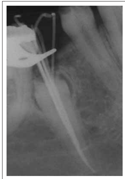
Figure 4. Partial fill radiograph.