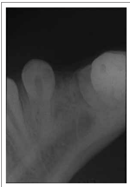
Figure 10. Occlusal radiograph.

Vitality thermal tests with ice were responsive for both teeth #21 and #19.